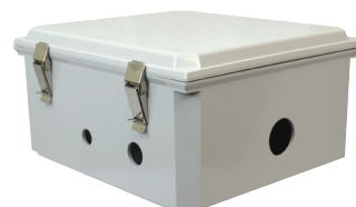
Custom Holes & Cutouts