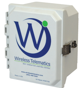
Silk Screen Printing