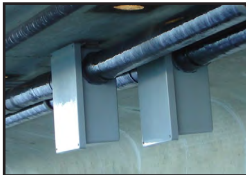
Power Junction Box