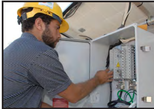
Solar Combiner Box