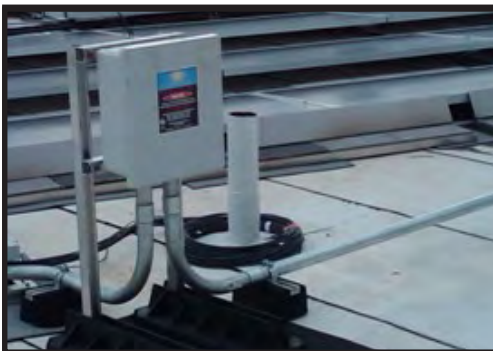
DC Combiner Box